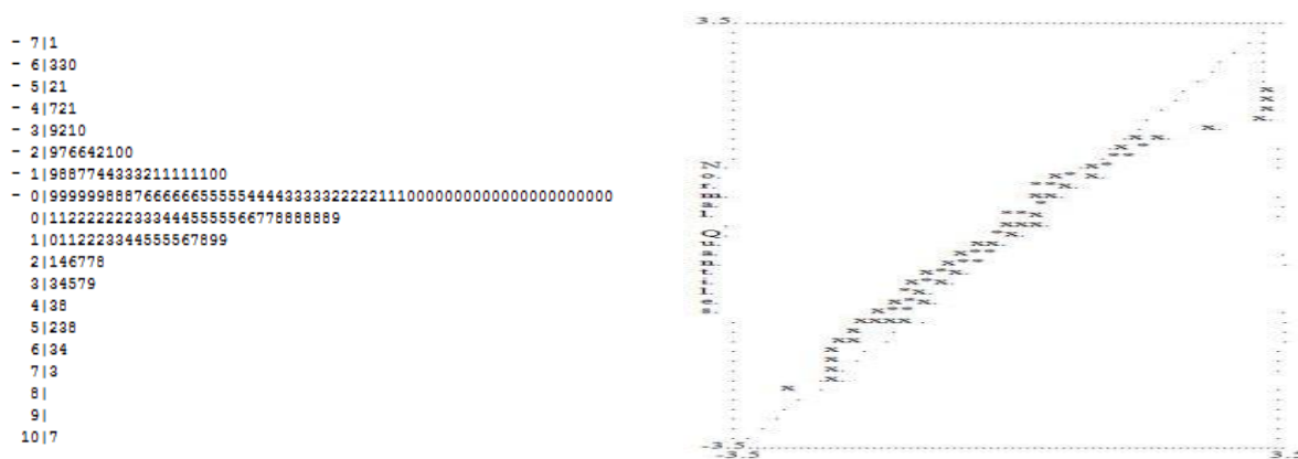
Figure 2. Stemleaf and Q-plot of the second-level model’s standardized residuals

The distribution of the model’s standardized residuals also reveals that the model is healthy. Figure 2 shows that the standardized residuals overall present a normal distribution and the Q–plot indicates an overall symmetric distribution nearby the diagonal.